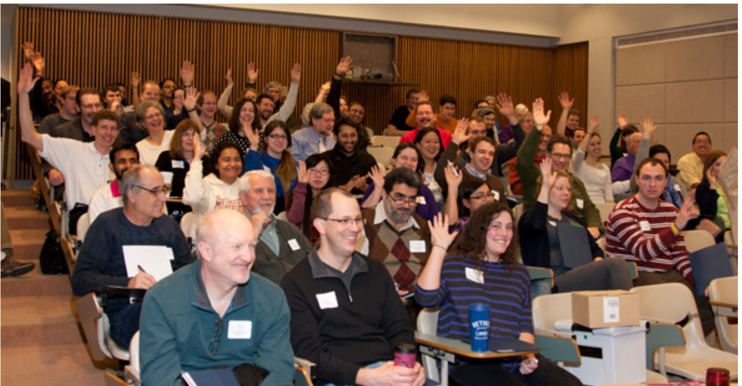
First-year volunteers at Science Bowl raise their hands

Your attention and time make all of it possible. You are giving them a gift that can motivate them to live their passion for a lifetime.