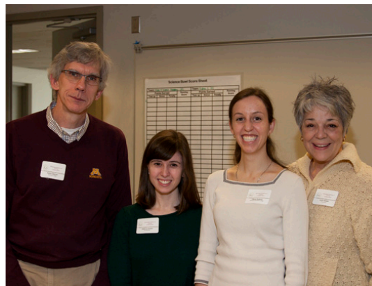
Science Bowl volunteers pause for a photo between rounds

Every year, the Minnesota Academy of Science relies on hundreds of volunteers to donate thousands of hours to not only make our programs successful, but to make them happen. In 2014, 738 volunteers donated 6,273 hours to Academy programs. We have a small budget and a small staff. So volunteers do everything from set-up to clean-up to