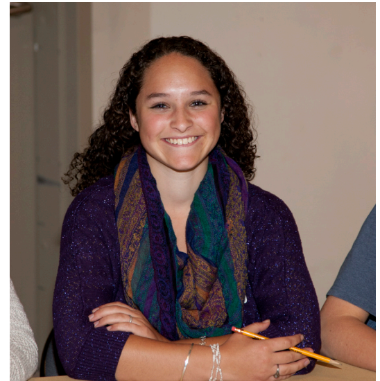
A student from Carlton High School poses for a photo

The breadth of topics covered, speed at which they must answer, and the ability to compete as both an individual, as well as part of team is an awesome opportunity for students.