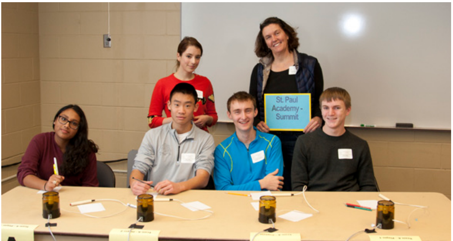
Students from St. Paul Academy gather for a group photo before a match